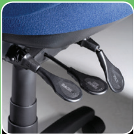
Seat Adjustment Mechanisms

The extensive modularity of the BodyBilt ergonomic chairs also means that you can build a completely bespoke solution for workers with specialised requirements. By using the modular components you can custom-build a unique chair from the ground up!