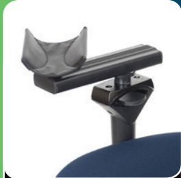
Linear Tracking Armrest