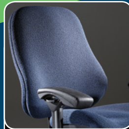
Thoracic Back Support